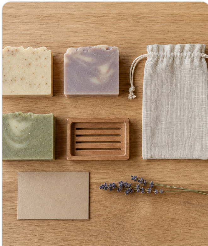
After: a polished listing-ready visual.