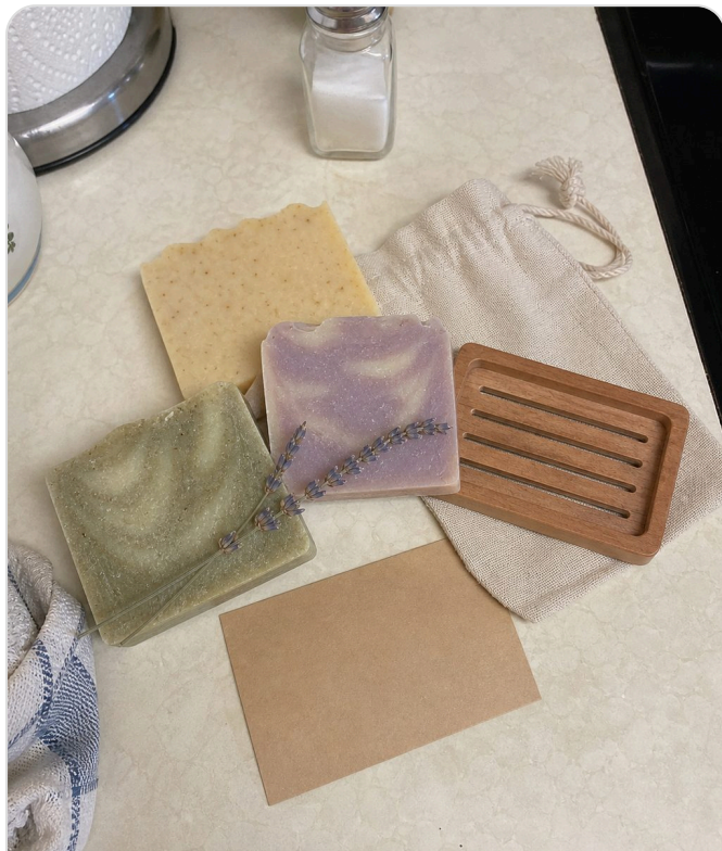
Before: a functional reference bundle.

The flagship prompt turns a simple list of order contents into a clean top-down bundle photo, useful for product pages and buyer confidence.